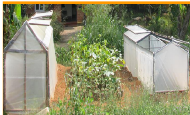
CO 2 Enrichment Chamber