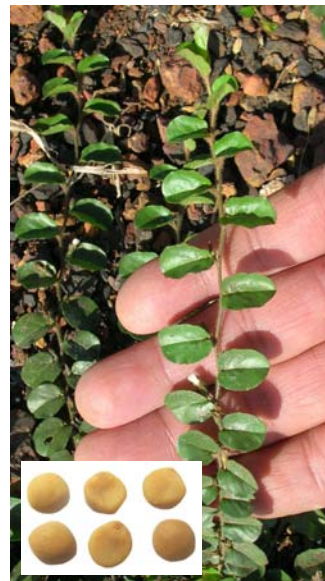
Seeds 2-4 mm, brown, ovoid-triangular, minutely tuberculate.