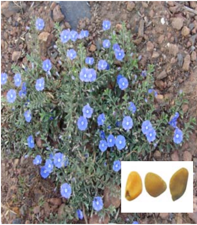
Capsule globose, 0.3-0.4 cm long, glabrous; Seeds usually 4, pale brown to black, ovoid-1.5-1.7 mm long,