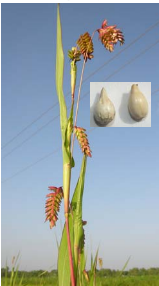
Fruit is a pseudocarp, 0.6-1.2 cm long, globose-broadly ovoid, white to slightly bluish white, hard and polished