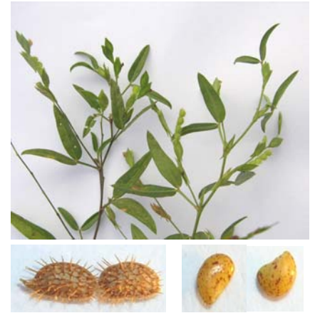
Pods jointed, muriculate with hooked, retrorsely hairy bristles. Seeds 3-5 mm long, kidney shaped, yellowish brown with dark brown spots