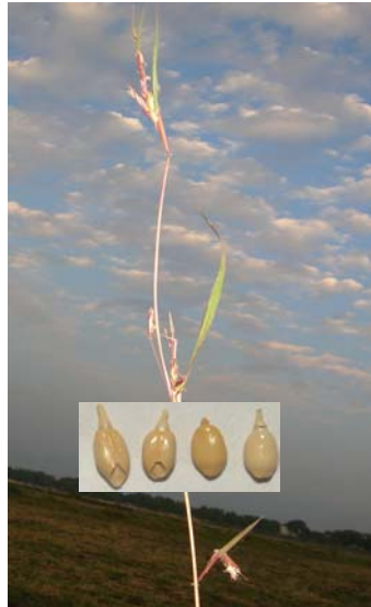
Seed (caryopsis) is 5-7 mm long, yellowish brown, resembles wheat grain.