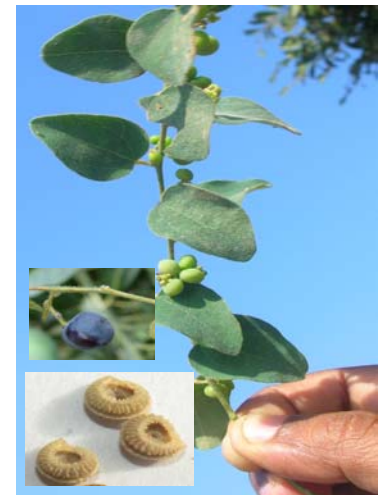
Fruit (drupe), compressed, pea sized, purplish black. 4-8 mm long, 4-5 mm broad. Endocarp annular or ribbed with a prominent dorsal crest, perforated.