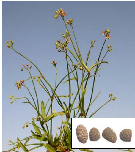
Seeds trigonous, 2-4 mm, pale brown, shallowly pitted.