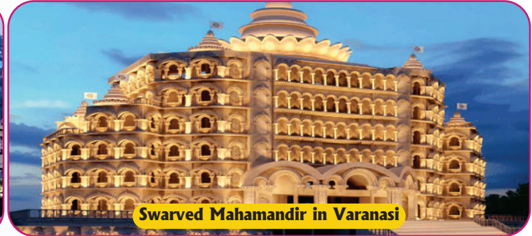
Swarved Mahamandir in Varanasi