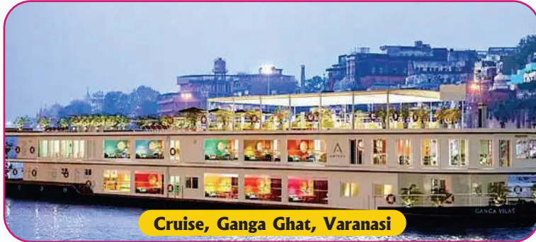
Cruise, Ganga Ghat, Varanasi