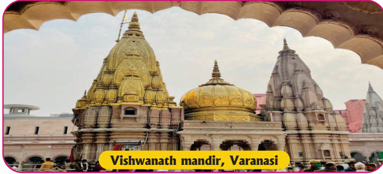
Vishwanath mandir, Varanasi