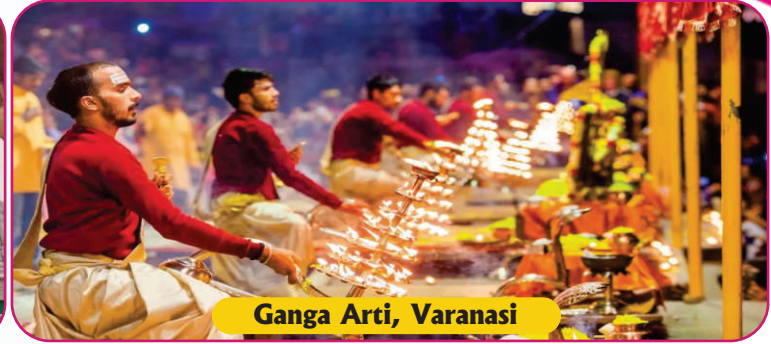
Ganga Arti, Varanasi