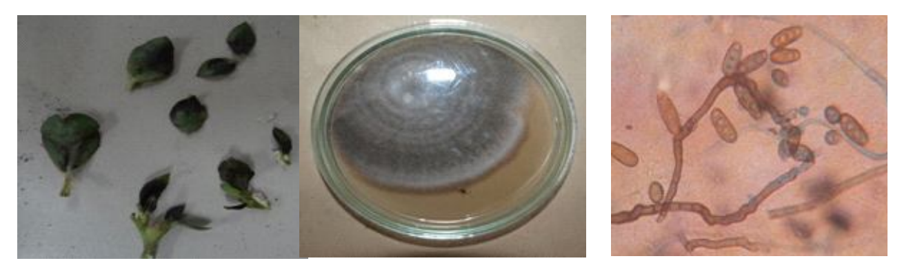
Figure 2. Cochliobolus spicifer (A) Leaf spots, (B) Growth on PDA plate, (C) 2-3 septate golden brown conidia of the fungus