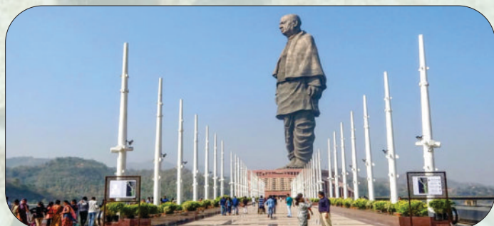
World tallest statue- Statue of Unity