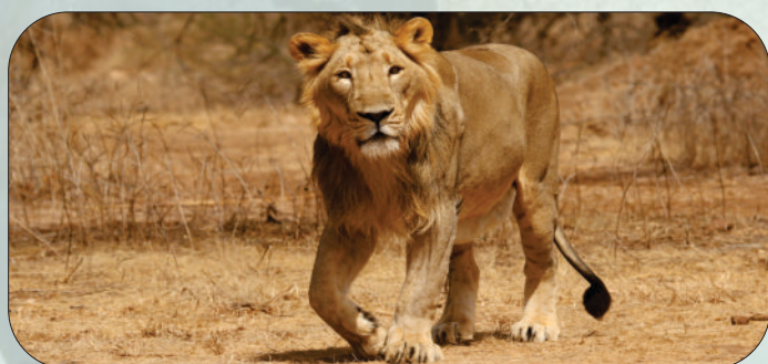
Gir National park- abode of Asiatic lion