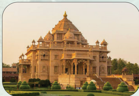
World famous Akshardham temple