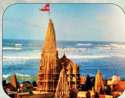
World famous Dwarikanath temple- dedicated to lord Krishna