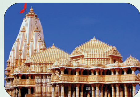
World famous Somnath temple- dedicated to lord Shiva