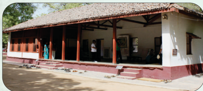
Mahatma Gandhi's Sabarmati Ashram